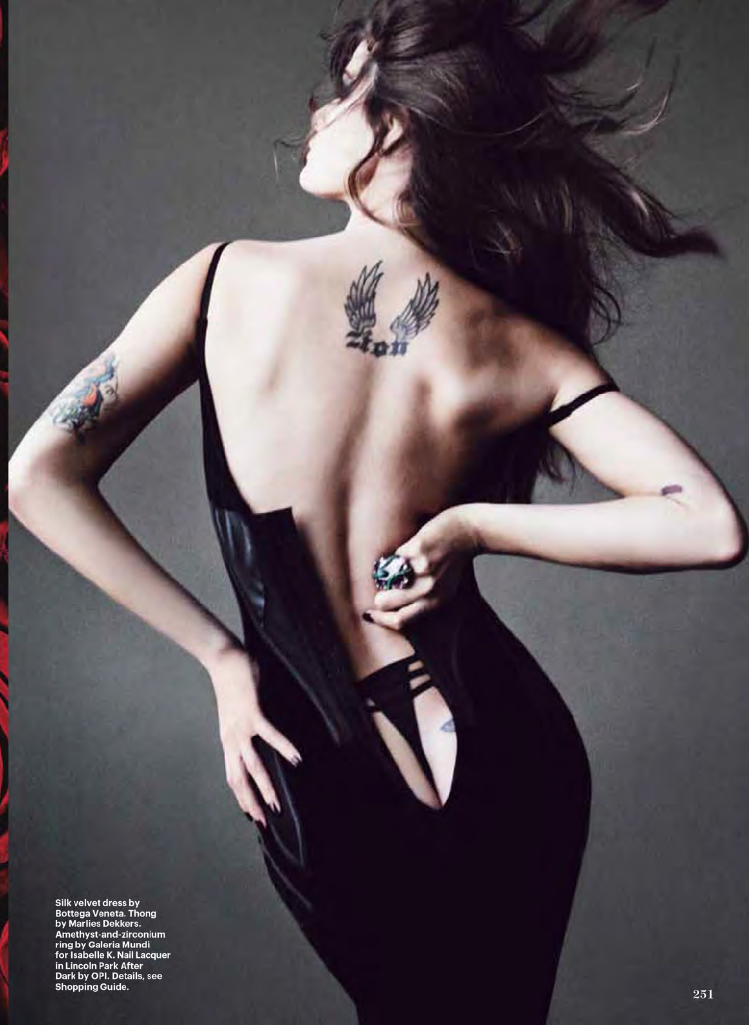
Silk velvet dress by Bottega Veneta. Thong by Marlies Dekkers. Amethyst-and-zirconium ring by Galeria Mundi for Isabelle K. Nail Lacquer in Lincoln Park After Dark by OPI. Details, see Shopping Guide.