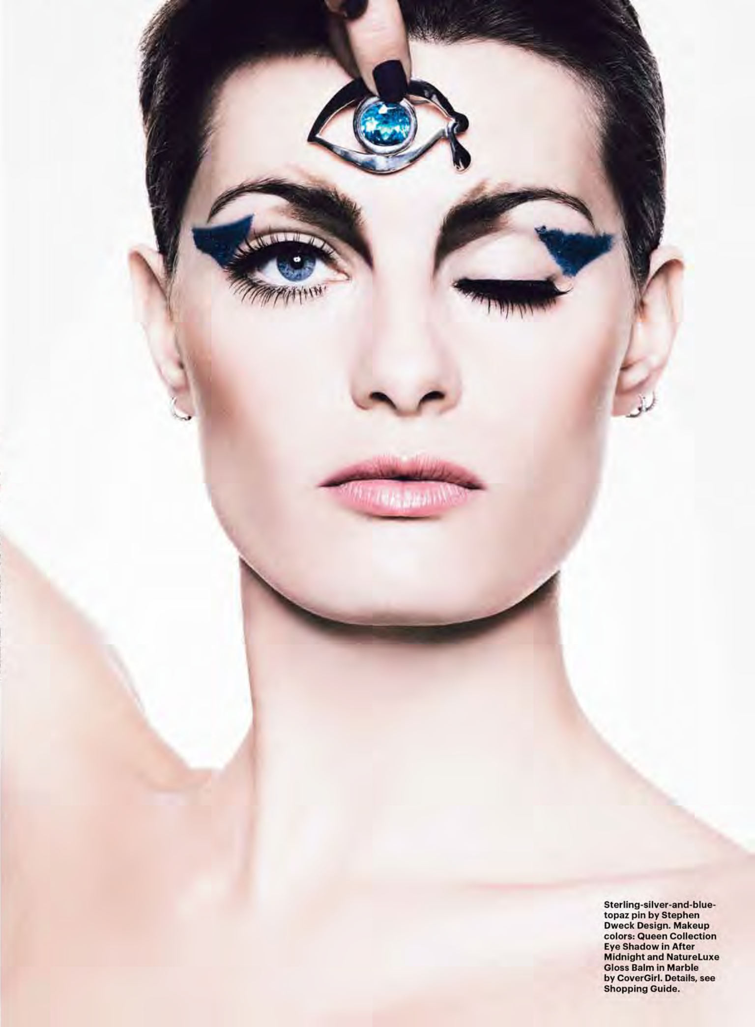
Sterling-silver-and-blue-topaz pin by Stephen Dweck Design. Makeup colors: Queen Collection Eye Shadow in After Midnight and NatureLuxe Gloss Balm in Marble by CoverGirl. Details, see Shopping Guide.