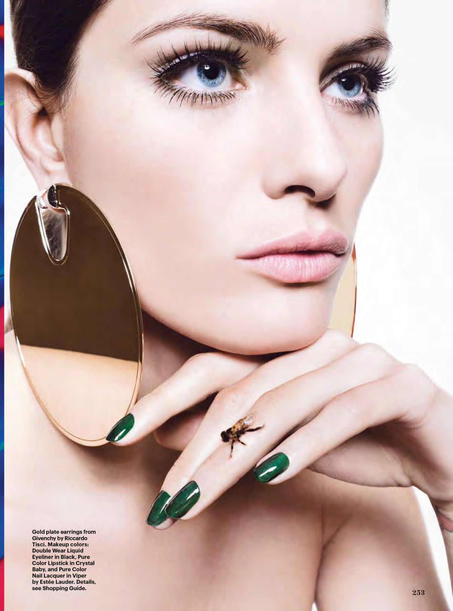
Gold plate earrings from Givenchy by Riccardo Tisci. Makeup colors: Double Wear Liquid Eyeliner in Black, Pure Color Lipstick in Crystal Baby, and Pure Color Nail Lacquer in Viper by Estée Lauder. Details, see Shopping Guide.